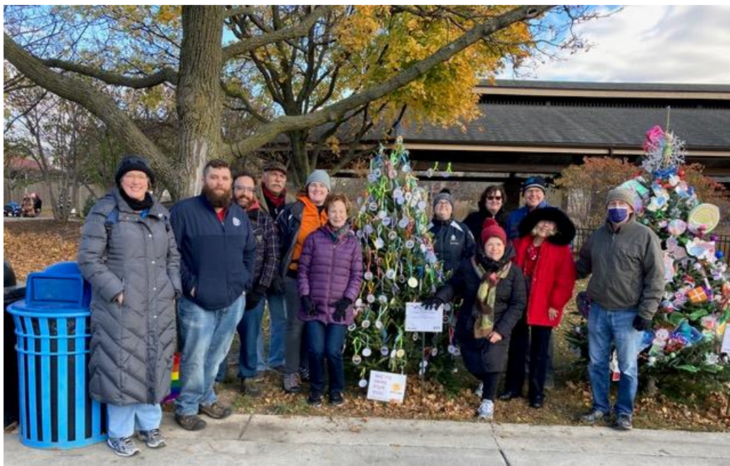
PFLAG Hinsdale decorated a tree at Brookfield Zoo

At our December meeting, we'll gather and enjoy a meal together, something we haven't done during Covid. We will not have a speaker in January, as our meeting falls on New Year's Day.